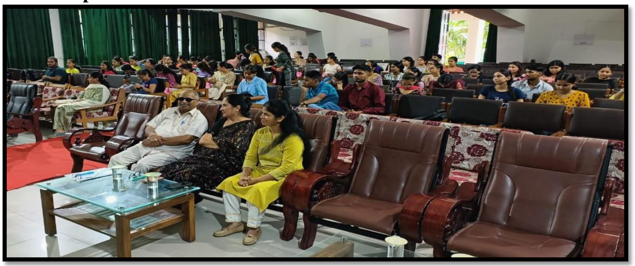
Few Glimpses of the event: